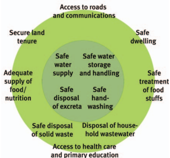
Figure 1: Basic services and safe practices

The above considerations cast doubt on the wisdom of systematically attaching the S&H components of WASH, WSS and WES to the policy 'bandwagon' of water supply. The S&H elements, the younger sisters, are politically weaker, when compared with their elder brother. The downside